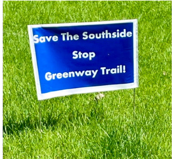
A few neighbors apparently think the project will destroy the City's south side.