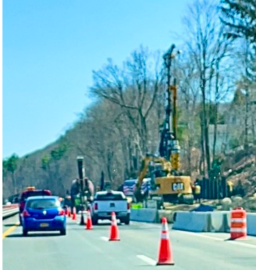
April 8, 2021

The Two Rivers Greenway system (spanning Broome and Tioga Counties) will be getting a major element added. NYS DOT has authorized building the 434 Greenway, a multi-use trail to ultimately connect downtown Binghamton with the Binghamton University campus. After much planning, community input, property acquisition, soil analyses, bid-letting, contracts, etc., construction proceeds apace. There was resistance from some neighbors about connecting Vestal Avenue to the Greenway at Ivanhoe Road—however the connector remains in the final plan. There is some disruption of highway traffic on the Binghamton section of the Vestal Parkway, and there will likely be more when construction reaches the intersection of Vestal Avenue and the Parkway where fast, moderate and slow-moving transit modes come together in a small area.